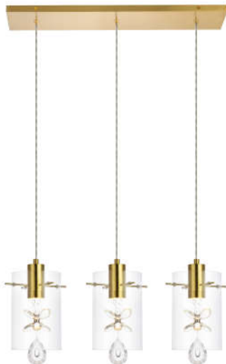
Gold Item No:5202D24G